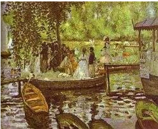
La Grenouillère 1869. The impressionist nature of this early painting is quite clear.

A prolific artist, he made several thousand paintings. The warm sensuality of Renoir's style made his paintings some of the most well-known and reproduced works in the history of art. The single largest collection of his works—181 paintings in all—is at the Barnes Foundation, near Philadelphia, Pennsylvania.