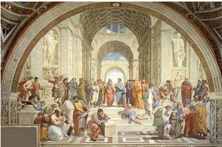
(The School of Athens by Raphael. This Renaissance painting shows an imaginary scene from Ancient Greece, with many famous Greek philosophers, writers, artists and mathematicians. Raphael has used the faces of lots of famous people from his own time. He has used Leonardo da Vinci as his model for Plato, the philosopher with the white beard in the centre.)

1) The word Classicism , in the arts, is used when talking about art from the Ancient Greeks and Romans and their influence. The art of classicism often involves a thoughtful approach to the arts in which beauty and form is admired, rather than passion or any kind of exaggeration. Classicism influenced several periods in European history, especially the Italian Renaissance, Age of Reason, the Age of Enlightenment and some movements in Modernism. Classicism can apply to painting, sculpture, architecture, music, dance, literature or philosophy.